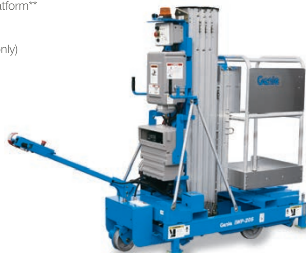
Shown with optional power wheel assist

* Adds 12.5 in (.32 m) to unit length and 285 lbs (129 kg) to unit weight, DC only