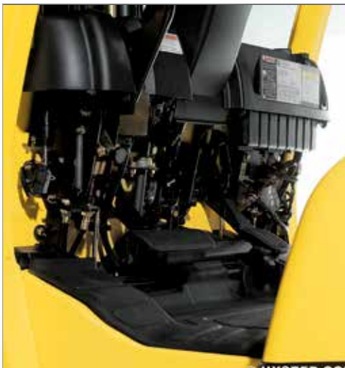
Easy service access