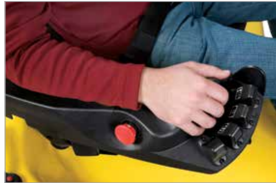
Electro-hydraulic controls with TouchPoint mini-levers