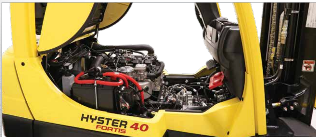
PSI 2.4L LPG Engine

SOSlocation.ca VENTE · LOCATION · SERVICE · TRANSPORT 1-833-360-3330