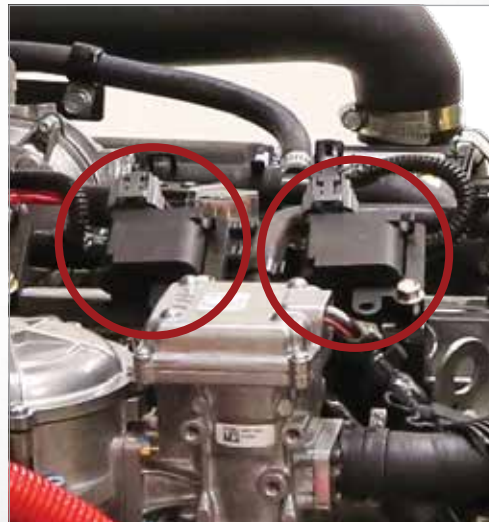
Coil over plug ignition design