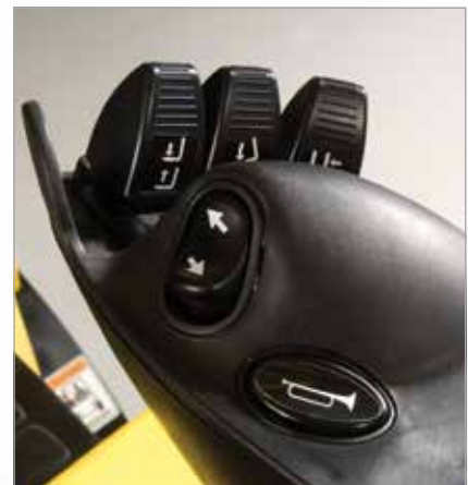
Seatside Directional Control