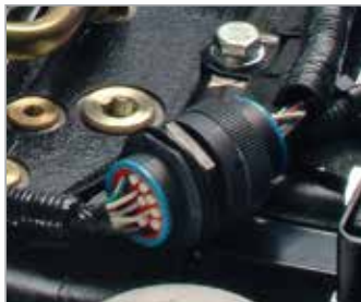
IP66 Sealed Connector