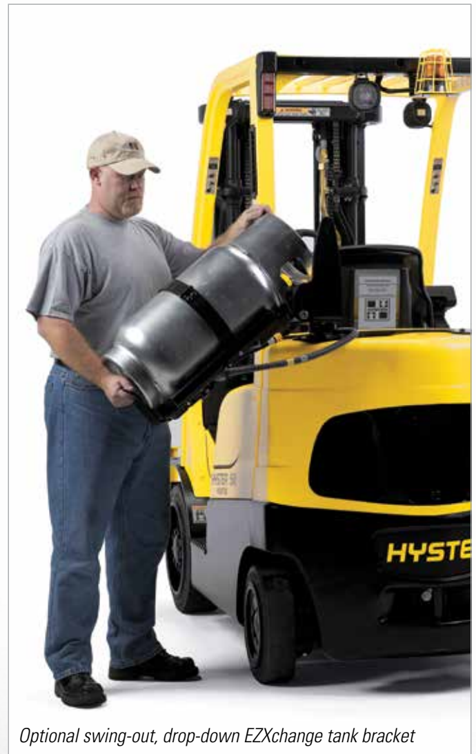
Optional swing-out, drop-down EZXchange tank bracket