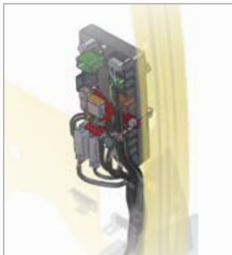
VSM Industrial Computer

Industrial lift truck downtime results from problems with the powertrain, electrical system, cooling system or hydraulic system. Advanced design of the H40-70FT truck series has reduced downtime by up to 30%. In addition, the Hyster® dealer network is able to respond swiftly to any downtime reported and provide a quick service solution. Furthermore, the Fortis® truck series offers excellent service access to allow for easy maintenance. Together these factors assist you in maintaining maximum productivity in your operation.